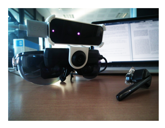
Fig. 2. Leap Motion Controller, Vuzix AR Glasses and Plantronic Headset

dictionary. Although in some cases convenient, continuous speech recognition has the drawback of generating a lot of false positive detections in noisy environments. As a solution, the present paper proposes to tie it to a specific gesture, in order to de/activate it at will. The interface features a few, key vocal commands, in order not to force the user to remember too many words and to improve the recognition rate. Moreover, the commands are context-dependent, in order to minimize the number of false positives .