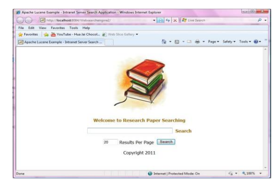
Figure 2. Research Paper Searching web page.

In the experiments, an indexer was developed. Equation (4) shows a modified Term Frequency/Inverse Document Frequency (TF/IDF) formula for the indexer. Here, TTA corresponds to tag, title with abstract [2]. Fig. 2 shows an example of the interface web page developed in the experiment. Here, the subject can specify their search criteria and investigate the results from each search engine. The number of the results per page can also be defined. In addition, the subject can view the results by title, abstract and the full text.