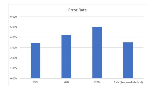
Figure 3: Error Rate Comparison of proposed method with existing methods

As shown in the Table 1, Accuracy of the SVM in predicting temperature in 84.52%, KNN is 91.21%, LSTM is 89.5% and ANN (Proposed Method) is 98.4%. Sensitivity of the SVM is 89.54%, KNN is 81.52%, LSTM is 84.24% and the proposed method is 94.21%. The specificity of the SVM is 80.45%, KNN is 88%, the LSTM is 89.54% and the Proposed Method is 96.54%. The Precision of the SVM is 82.24%, KNN is 85.42%, LSTM is 90.24% and Proposed Method is 96%.F1 Score of the SVM is 75.45%, KNN is 76.41%, LSTM is 72.24% and Proposed ANN method is 77%.