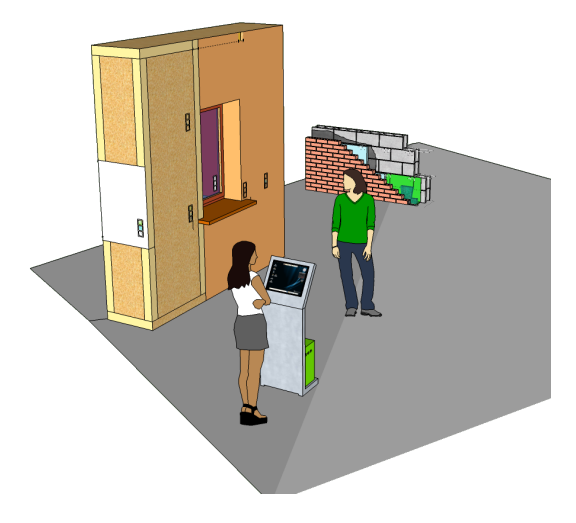
Figure 4. The Exhibition Scenario with Physical Artifacts