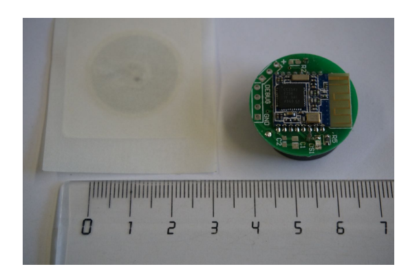
Figure 2. Size Comparison (in cm) of Near Field Communication (left) and Bluetooth Low Energy Chips (right)

Near Field Communication (NFC) is a contactfree technology for transferring small chunks of information between devices equipped with NFC hardware. The principle is established in public transportation ticketing systems and credit cards; the microchip that is usually embedded in the cards has to be held close to the reader for a short amount of time so that the data on the NFC chip can be read out and processed in another step. NFC typically works over a range of a few millimeters; it has an active and a passive mode. The active mode allows two NFC devices to actively exchange information over a wireless link; the speed is usually as low as around 100-400 kilobits per second, which is satisfactory fast for the minimal amount of information that NFC devices exchange. In the passive mode, the accessing device is sending out wireless waves on a specific frequency. Via electromagnetic induction, the field in the sending circuit on the NFC chip is activated and