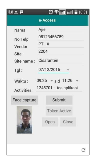
Fig.4. The display on an Android smartphone.

For the smart key to work, the engineer must enter the 5V voltage from the power bank to the smart key via the USB port available at the bottom of the smart key. A moment later the smart key will live which is marked by the active, crucial intelligent SSID with the name 'eAccess.' This SSID is encrypted with WPA2 technology so that not all WIFI clients can connect to it. To link to this SSID, the smartphone engineer must know the SSID password. The password is in the token that the NOC will later give when the engineer finishes asking for permission through the application.