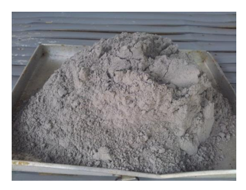
Fig. 1. Rice husk ash with fineness mess no. 100.

Rice husk ash from the by-product of burning bricks is heated at a surface temperature of about 277°C and the temperature in the pile of burning bricks is around 404°C.