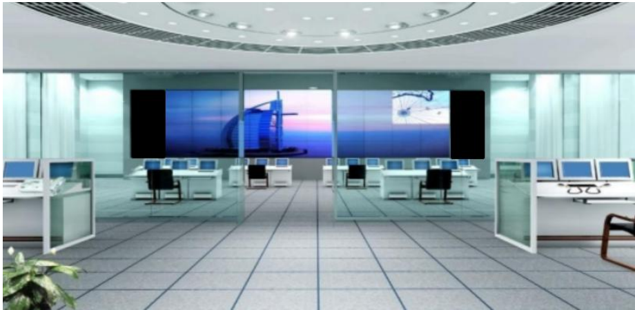
Fig. 2. Structure diagram of Computer Laboratory.

The computer laboratory is also accompanied by unexpected situations such as electric leakage, congestion and accidental contact, which need specific analysis. Figure 2 shows the structure diagram of a computer laboratory.