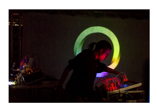
Figure 2. The first author performing with the prototype synthesizer at Ääniaalto 2018

The currently developed instrument in an audiovisual setting very clearly adheres to audiovisual composition where image and audio are both modulated from a third control voltage source [13]. Patching amplitude envelopes to the audio source as well as a parameter in the video synth creates immediate synchronicity towards building added value [8]. Patching gate sequences to 'system' and 'subsystem' in time with audio intervals also creates distinct sound-image events and compositional structures [18]. For example, gate sequences clocking the main sequence can be patched in parallel to change the 'system' or 'subsystem' parameters. Within a patch, the envelop driving the amplitude can be used to also change any CV-addressable parameter of a shader.