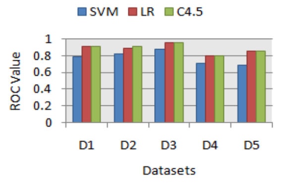
Figure 3. Prediction results of machine learning techniques in terms of ROC value for different datasets based on temporal and spatial contexts.