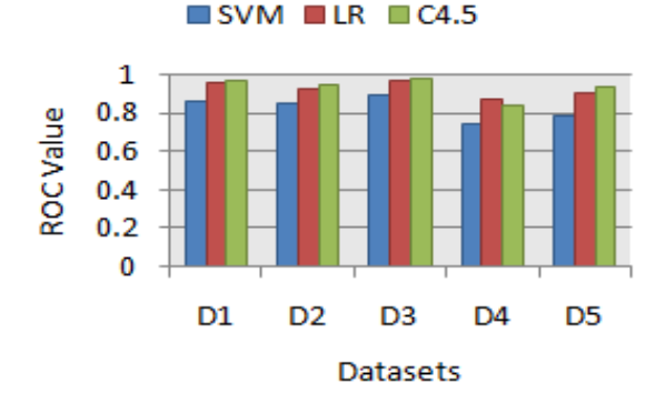
Figure 4. Prediction results of machine learning techniques in terms of ROC value for different datasets based on temporal, spatial and data-centric social contexts

to build an effective prediction model using machine learning techniques for the purpose of developing relevant contact-specific real-life mobile applications for the benefit of end users.