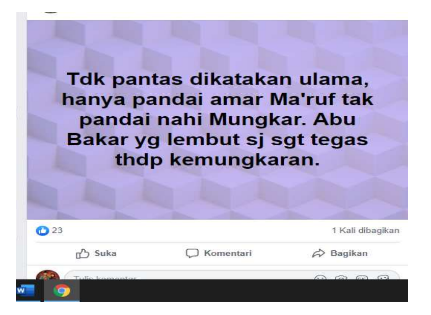
Fig. 2. Hoax and Hate Speech 2