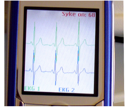
Figure 2. The phone screen when the signal drawing mode is activated.

The application receives the data sent by the measurement device, saves it to a file in the phone and separates the two channels of the ECG signal for the analysis. In addition, the received data is saved to a separate buffer to keep the last 56 seconds of the measurement data stored for the possible transmission to a health care server. The reason of using different buffer for this task is that reading from the end of the file where all the data is saved would be time consuming when the file gets big enough.