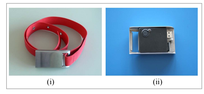
Figure 2. Belt buckle front side (i), belt buckle back side (ii) [13]

For our proposes, we use the actibelt<sup>®</sup> of Trium Analysis Online GmbH<sup>6</sup> and a corresponding software environment to collect and analyze the activity data of MS patients. It has the advantage of being embedded in a daily wearable belt close to the body's centre of mass and therefore it is unobtrusive and does not disturb the test person in its daily life. The belt is in operation if the button on the backside is pressed for three seconds and the LED close to the button blinks every three seconds. The actibelt<sup>®</sup> is switched off if the button is pressed again for three seconds and the LED stops blinking.