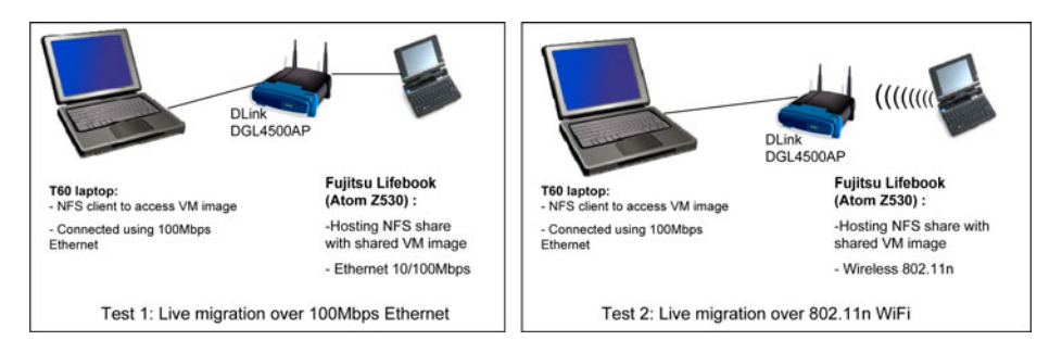
Fig. 3. Two test environments used to capture live migration timings

Of the above mentioned products, KVM is an open-source kernel virtual-machine infrastructure based on hardware virtualization support available in most of today's processors (Intel's VT and AMD's SVM). KVM adds virtualization capabilities to the Linux kernel while benefiting from its memory management and scheduling algorithms, such that VMs exist as regular Linux processes. KVM leverages processor extensions for hardware virtualization and has a performance advantage over software emulation based solutions. KVM live migration uses an NFS mounted shared disk space to store the guest VM image which needs to be accessible from both source and target migration end-points. The KVM live migration algorithm makes use of a cyclic process of copying dirty memory pages from the source to the destination. A write access to a page that has already been copied causes it to be re-marked as dirty and it needs to be copied again in the next cycle. When the number of dirty pages falls below a certain threshold, the cycle is stopped and the rest of the dirty pages are copied to the destination; at which point the VM has been completely migrated.